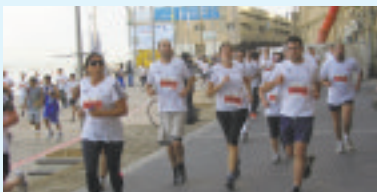
Tel Aviv Marathon 2011

Sea of Galilee Winter Marathon: It's the "lowest" marathon in the world at 200 metres below sea level. The flat 42.195-kilometre asphalt out-and-back course follows the shoreline of the Kinneret and winds through the Jordan Valley's historical landmarks. Jan. 8, 2016, tiberias-marathon.co.il.