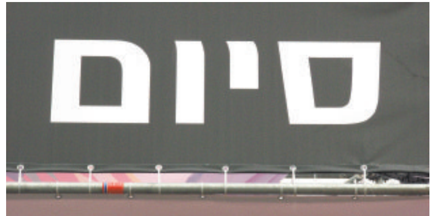
Jerusalem Marathon finish line