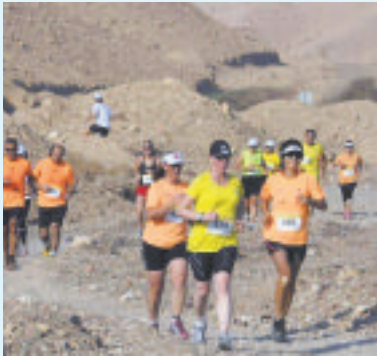
Desert Marathon Eilat 2014