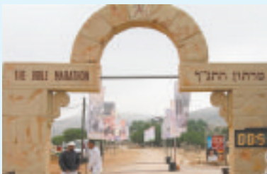
The Bible Marathon

Tel Aviv Samsung Marathon: Billed as a "non-stop party in a non-stop city," this flat multi-course along the seashore and city streets attracts 35,000 people for 5K, 10K, half and full marathons, kids "mini marathon" and 42K handcycle. Feb. 26, 2016, tlvmarathon.co.il.